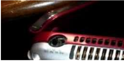
Power Port & Charger Broken