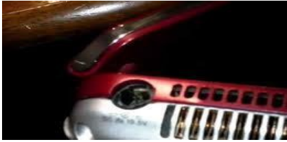
Power Port & Charger Broken